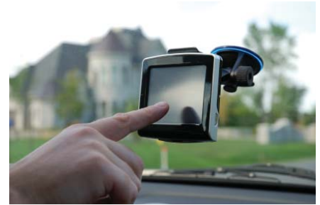
TouchSense tactile feedback supplies a familiar sense of confirmation very much like mechanical buttons provide.

When the user touches the screen, a position signal is sent to the microprocessor. The host application interprets this position and commands the lightweight TouchSense player, embedded on the processor, to play a specified tactile effect. The player responds by exerting control over a small actuator, causing it to play the tactile effect, which gives the user the perception of pressing a button.